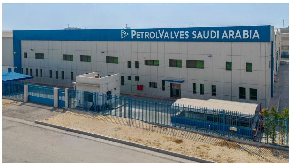
SAUDI ARABIA DAMMAM 11.000 SQM

To provide optimal support to our clients and end-users, PetroValves has pursued a policy of proximity to our installed base since the early 1990s. This has been achieved through the establishment of dedicated Service Shops and satellite facilities in strategic locations, as well as by forging partnerships with authorized Service Shops.