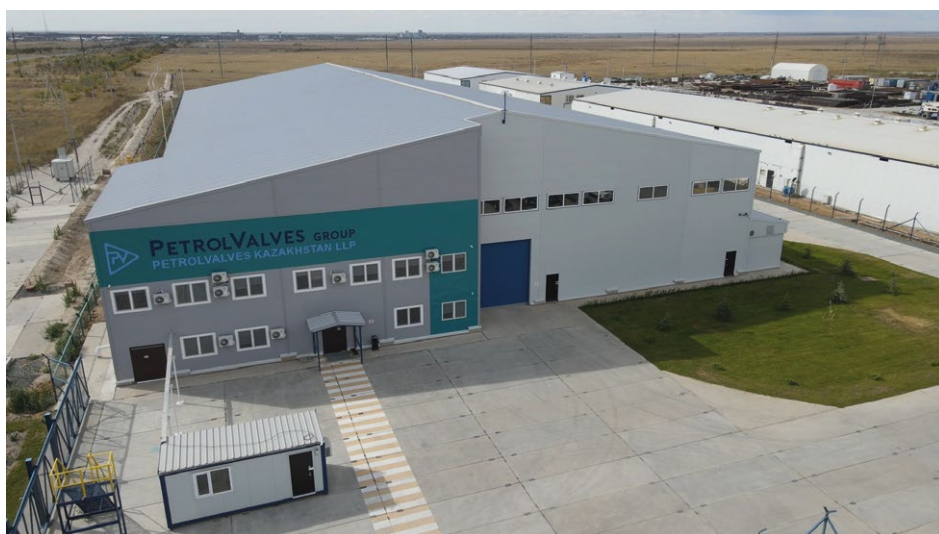
KAZAKHSTAN AKSAI 5.000 SQM